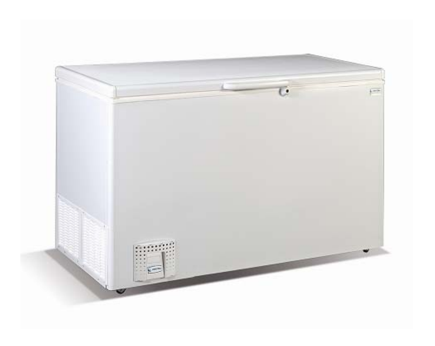
MODEL IRAKLIS 26 ,36 ,46, 56