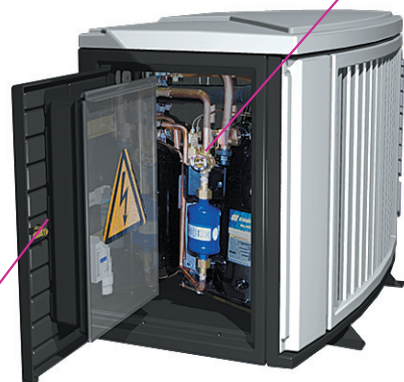
Easy access to electrical panel