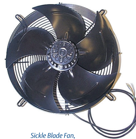
Sickle Blade Fan, contributes to low sound